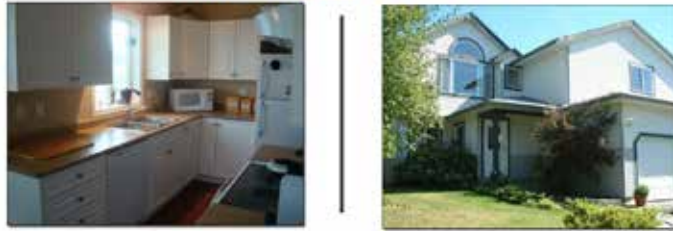
professional photography used when I listed and sold the same two homes