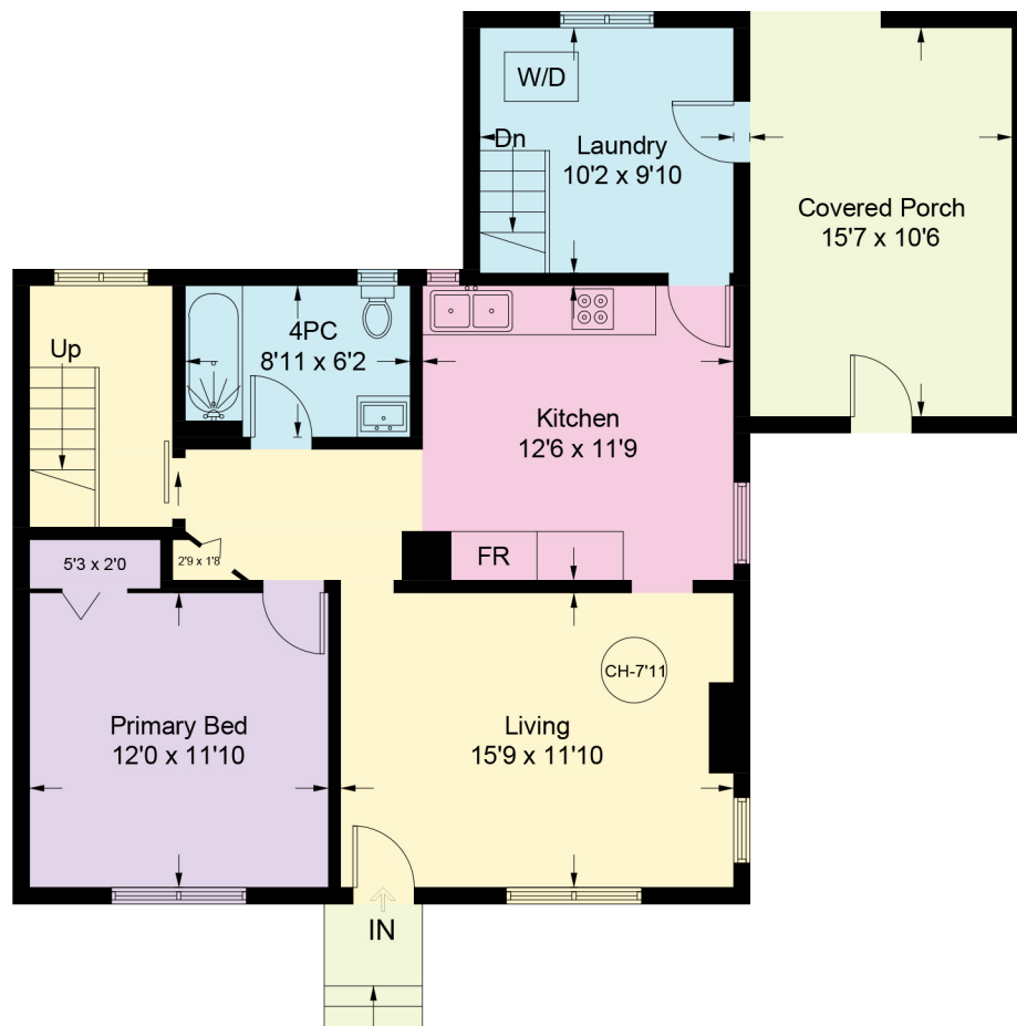
Main Floor - 870 sq ft