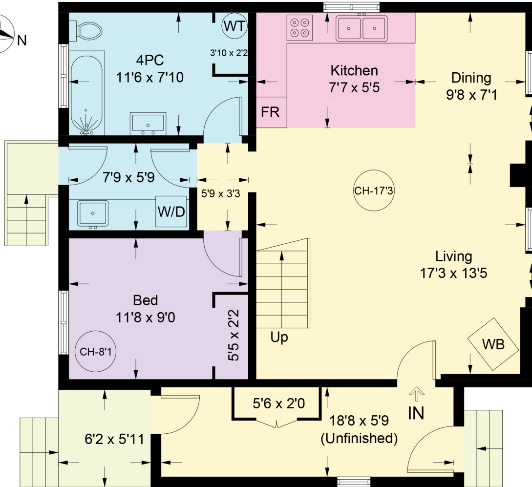
Main Floor - 722 sq ft